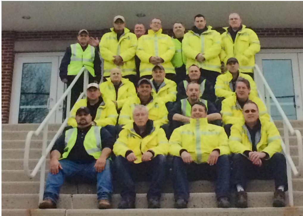
WORK PLACE SAFETY