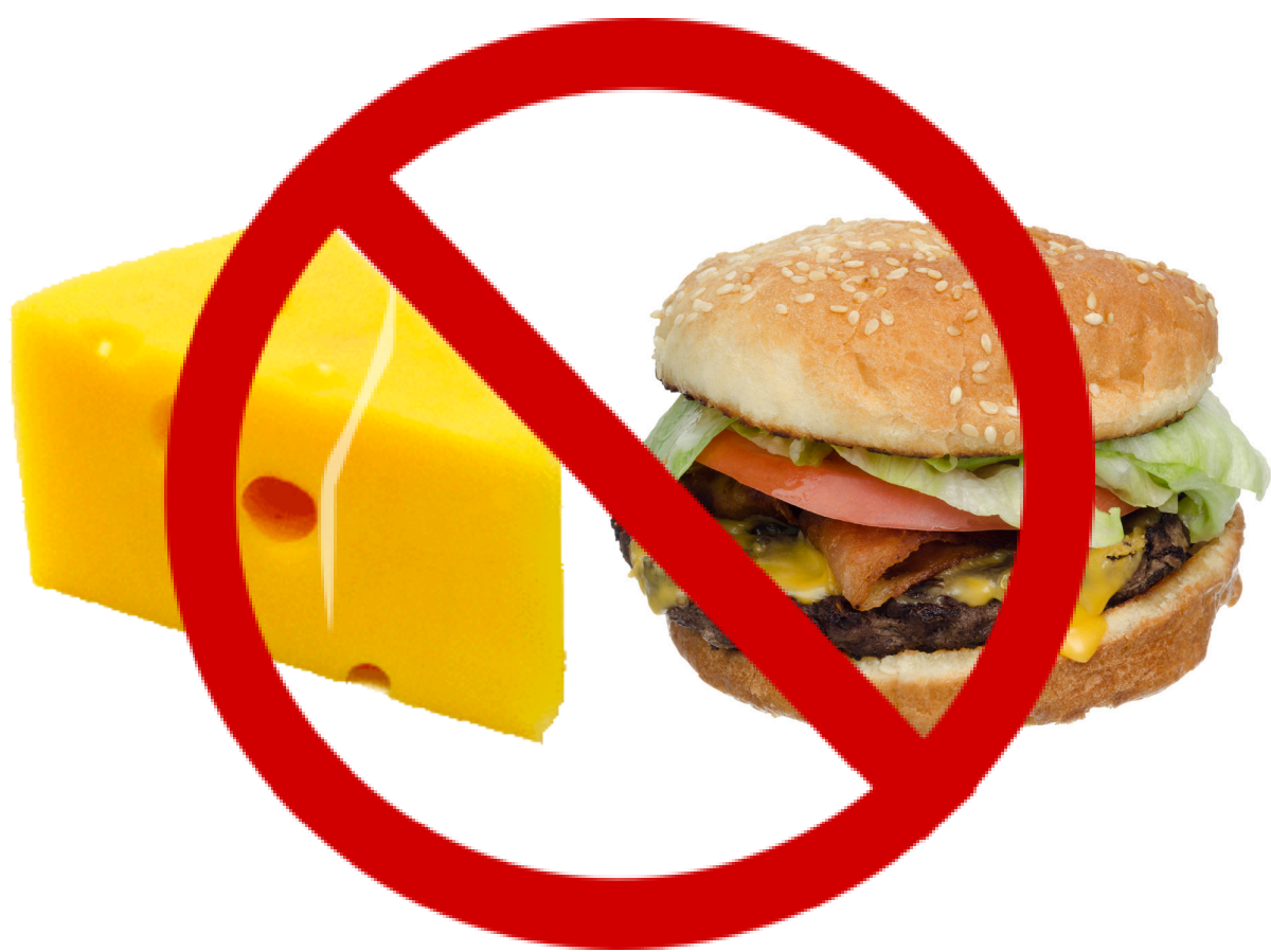
NO Dairy or Meat