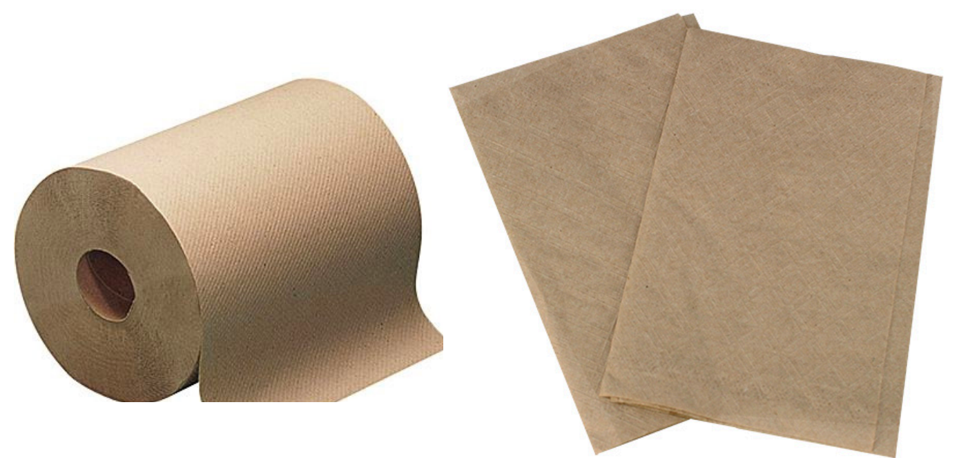
Unbleached Napkins & Paper Towels