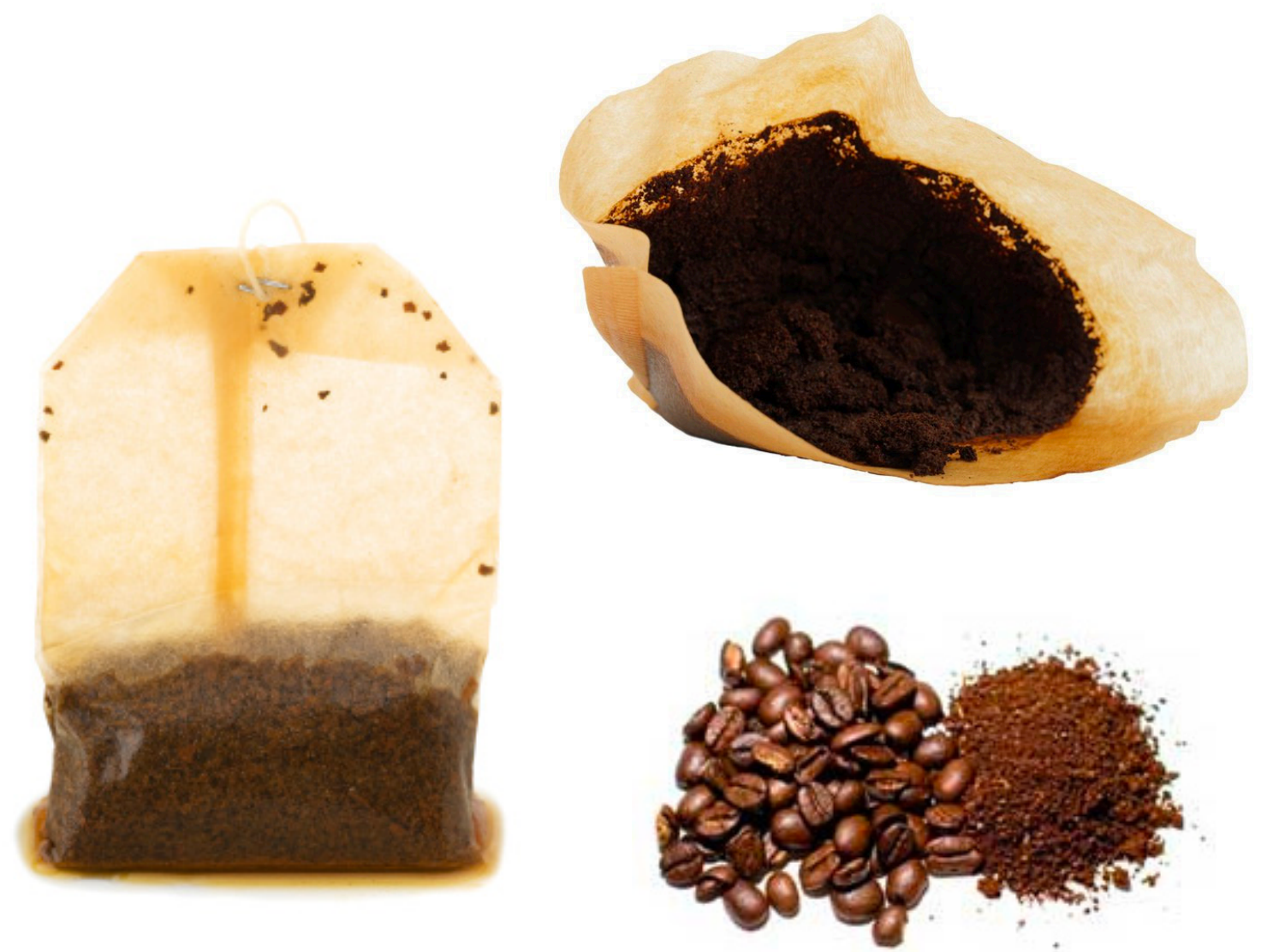
Paper Tea Bags & Coffee Grounds